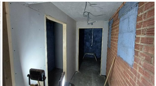
New toilet cubicle partitioning in progress

A second phase of the project is to remove the old kitchen, screed the floor to the same level as the hall and install new kitchen units kindly donated by Watermark. The kitchen will be finished and up and running again for Easter Saturday and is a stunning contemporary design.