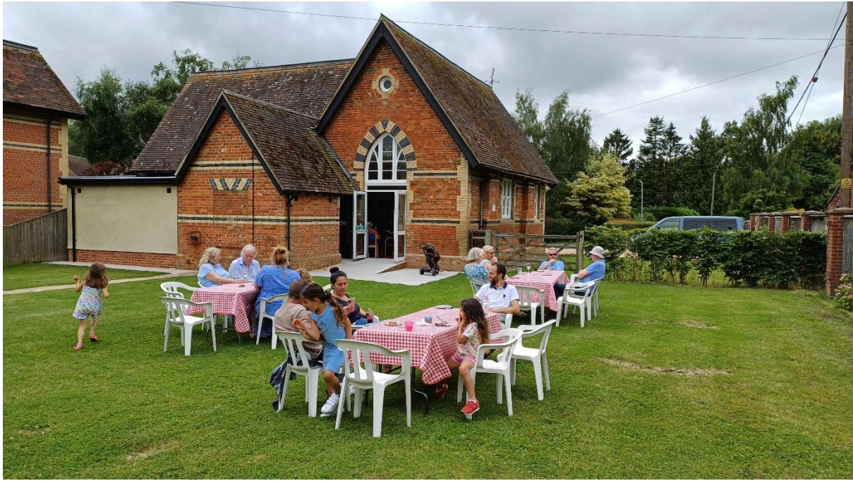
Open Day visitors relaxing outdoors in the garden