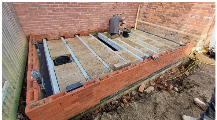
Block and beam construction