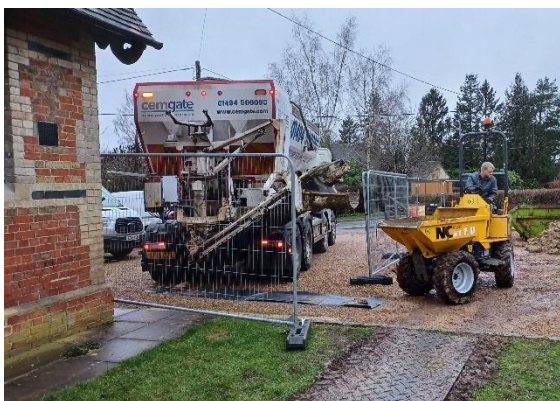
Concrete delivery for foundations

The main building contract started as planned on Monday 5 February 2024 and after only two weeks our contractor Cotmore Construction Limited has made a flying start despite the weather throwing down a tonne of rain!. Most of the demolition and knock through work has been completed, the foundation trenches excavated and filled with mass concrete, the sub-drainage pipes and fittings installed, the block and beam flooring installed and the damp proof course laid. Building control has completed two inspections and approved the work done to date.