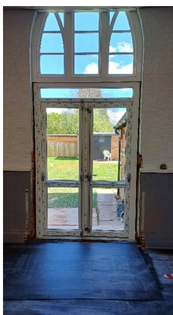
Internal and external views of the new garden door being fitted