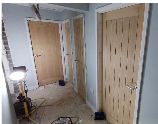
Toilet cubicle doors being fitted

By the end of April 2024 the village hall extension project was completed after three months of intensive effort by the project team, the main contractor, Cotmore Construction Limited, and all the suppliers and artisans pulled into the work. The results are very impressive and have considerably enhanced and modernised this Victorian village hall. We now have a spanking new toilet block with four individual cubicles (Ladies, Gents, Unisex and Disabled/Inclusive) with auto-lighting, auto extract ventilation and central hot and cold water feeds instead of individual sink heaters.