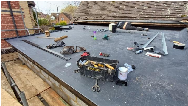
EPDM roof membrane being installed

The main contractor, Cotmore Construction Limited, has continued to make very good progress in the past month with the new toilet extension external walls, roofing and insulation all completed. The internal stud partitioning and floor screed is also done with plastering in progress alongside second fix plumbing and electrical installations.