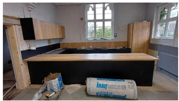
New kitchen units being installed