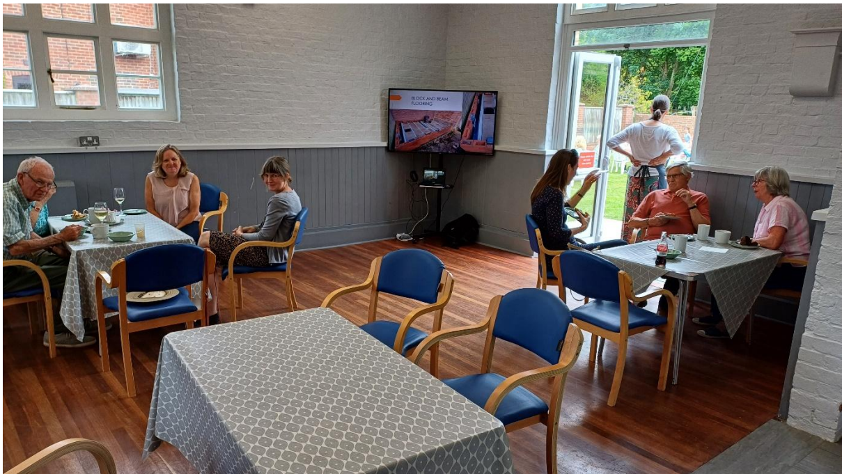
Open Day visitors relaxing indoors with photo slideshow in background