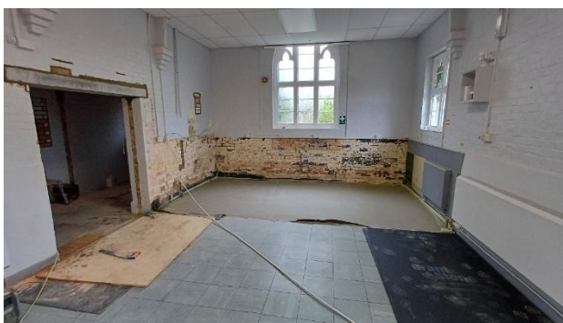
Old kitchen removed and floor screeded

A second phase of the project is to remove the old kitchen, screed the floor to the same level as the hall and install new kitchen units kindly donated by Watermark. The kitchen will be finished and up and running again for Easter Saturday and is a stunning contemporary design.